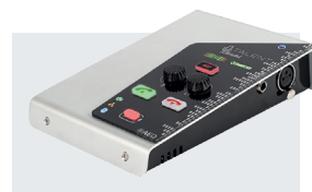
Phoenix Audiocodexs Family